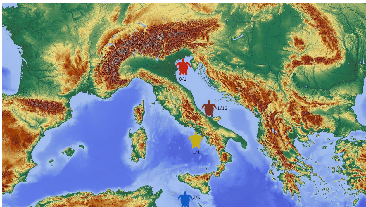
Fig. 1 Provenience of samples included in this study. Red turtle: Centro Recupero Animali Selvatici Il Benvenuto (Rovigo, Veneto); brown, CRTM Pescara (Abruzzo); blue, CRT of Lampedusa (Agrigento, Sicilia); yellow, Stazione Zoologica Anton Dohrn (Naples, Campania) Number of positive loggerhead turtles either by copromicroscopy or real time assay on blood is reported over the total number of samples collected from each locality.

Three out of 23 blood samples were positive by Taqman real time PCR with CT values ranging from 31.36