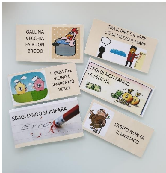
Figure 2: Italian idioms (property of authors)

Pre-text. The aim of this stage of the drama is to give learners some inspiration to create and enter the fictional world where the actual drama will take place (Dalziel & Piazzoli, 2019). Examples of pre-texts that can be used are photographs, pictures, songs or short videos (Piazzoli, 2018). The participants were often asked to describe a picture and to make guesses about its context.