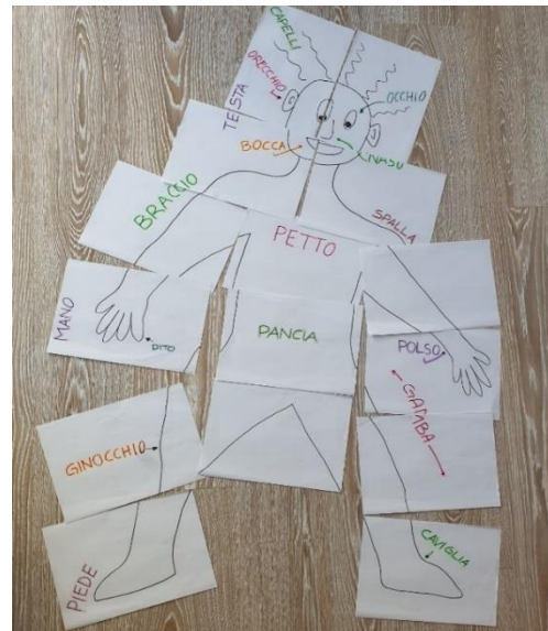
Figure 1: The Puzzled Man (property of authors)

Focus on Language. Since some of the participants were total beginners, some exercises aimed at providing them with the vocabulary they needed in the following activities. The Puzzled man (Figure 1) helped them to revise and learn the parts of the body by collaborating to understand how to complete the image. We also used Italian songs, whose words had been introduced using cards to link meanings and images, and Italian idioms (Figure 2), which the participants analyzed and compared with similar idioms in their own languages.