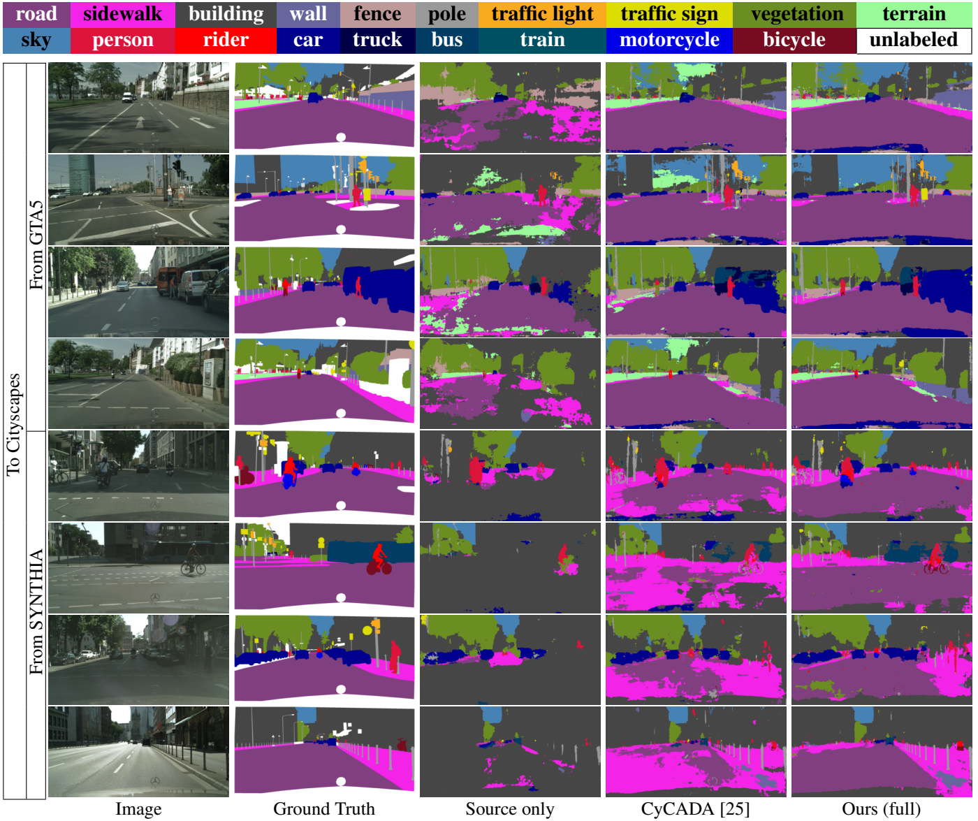
Figure 3: Semantic segmentation of some sample scenes extracted from the Cityscapes validation set when adapting source knowledge learned on the GTA5 (rows 1 – 4) and SYNTHIA (rows 5 – 8) datasets ( best viewed in colors ).