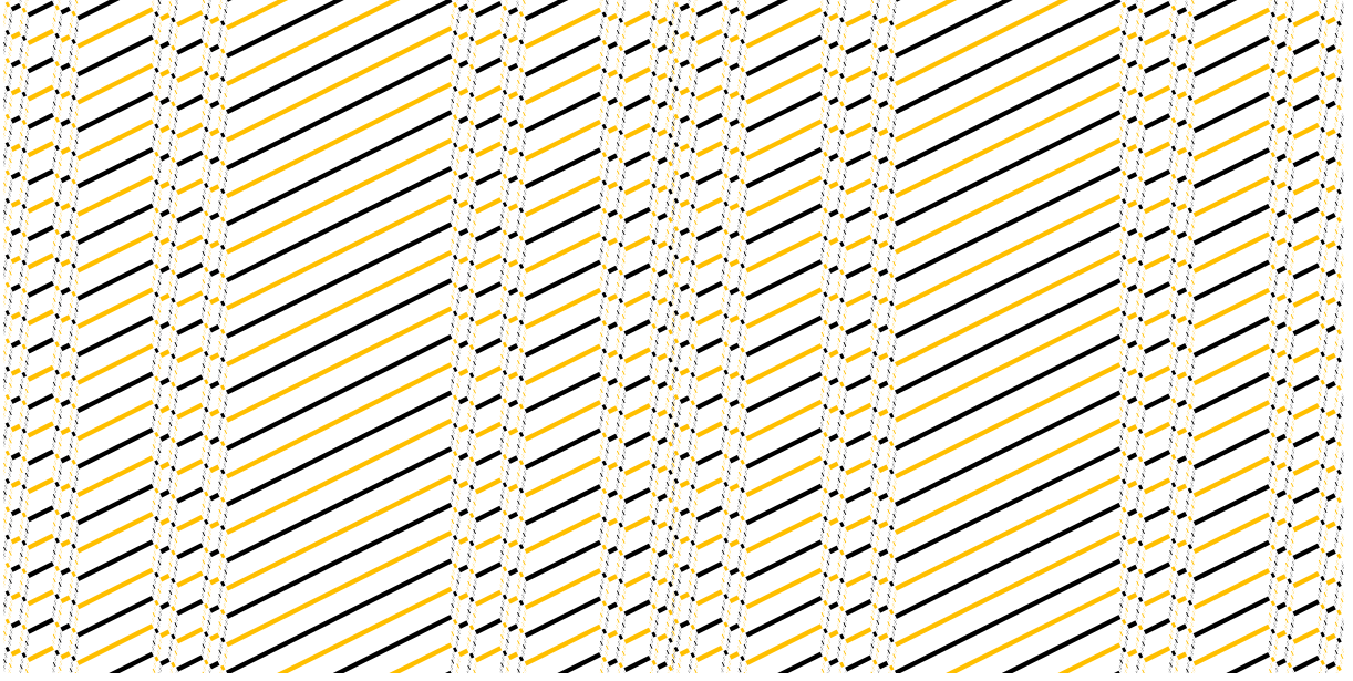
Figure 1: Curves satisfying \dot{\gamma}(s) = 1 almost everywhere might fail to be Lipschitz continuous: characteristic curves are indeed required to be absolutely continuous. Absolute continuity automatically improves to C^1 -regularity, due to the continuity of the field. They are then stable under uniform convergence.

Definition 6. We call a Lagrangian parameterization \chi absolutely continuous if (i_\chi^{-1})_\# \mathcal{L}^2 \ll \mathcal{L}^2 . Equivalently, \mathcal{L}^2 -positive measure sets can not be negligible along the characteristics of the parameterization \chi : \chi maps negligible sets into negligible sets.