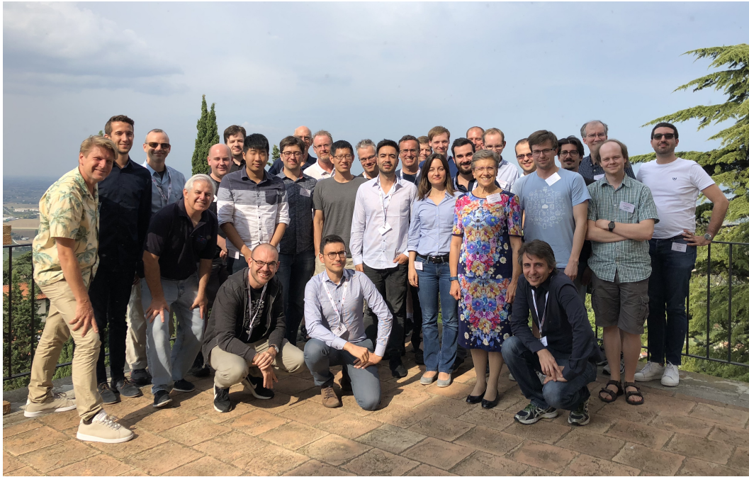
Figure 1: Bertinoro, 29 August 2018. DESIRES 2018 group picture taken on the Ce.U.B. terrace.