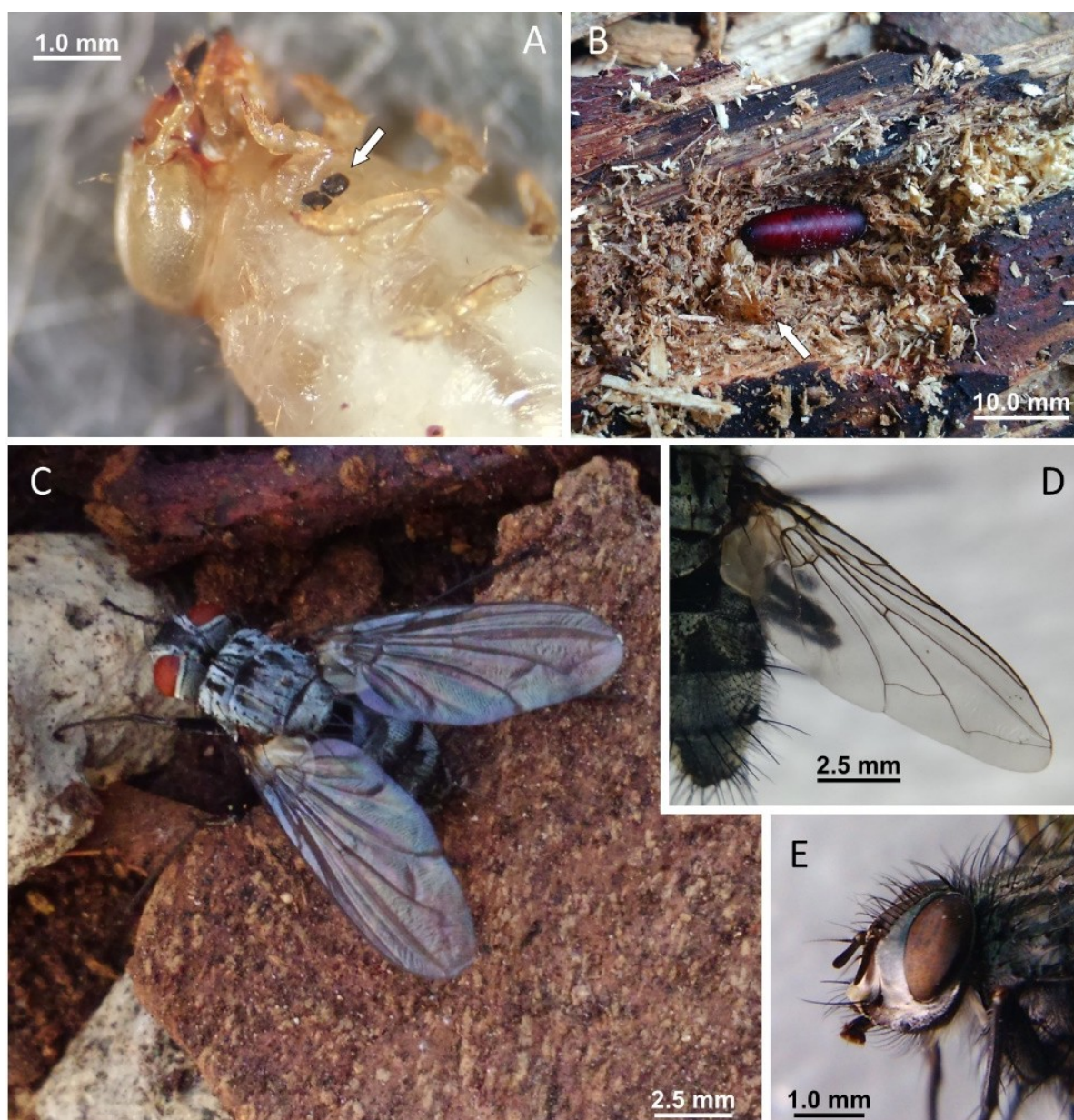
Figure 2. D. ferina . A) Parasitism of P. caraboides larva: protruded posterior spiracles are visible on the host prothorax (arrow); B) Puparium in field, with remains of the host (arrow), and a lot of frass in a soft wood; C) Adult habitus (female), about two hours after the eclosion; D) Right wing; E) Head (male). (In colour at www.bulletinofinsectology.org )