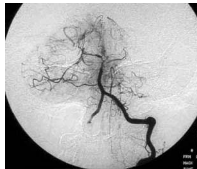
Figure 2 Carotid artery angiography.

trauma, sepsis, endocarditis, arthritis, oral contraceptive use, hypercoagulable state, and basilar artery dissection, no apparent cause was determined in the present case, or in many other cases. Fortunately the patient recovered completely. We should be vigilant for this condition if we see a child with acute consciousness disturbance since early intervention can prevent neurological sequelae.