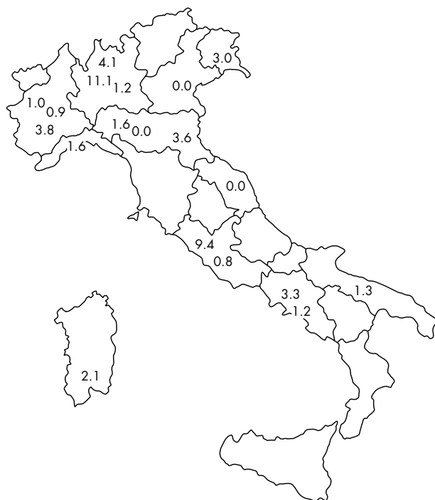
Figure 1 Child maltreatment suspected by paediatric emergency staff (%). Approximate locations of participating hospitals and ratios of children scoring 4 or above in "compatibility with the concept of child abuse or neglect, understood as physical, sexual, or mental harm (i.e. non-subjective evidence of injury suffered because of others, known or unknown)". Scale: 1, ruled out; 2, almost excluded; 3, very dubious; 4, dubious; 5, almost certain; 6, certain. Clinicians did not know what threshold was to be set.

The mean age (SD) of the patients was 4.8 (3.9) years. However, 57% of consultations were for children under 4. Fifty seven per cent were males. The distribution of suspected maltreatment varied significantly between hospitals (fig 1, \chi^2 p < 0.001 ).