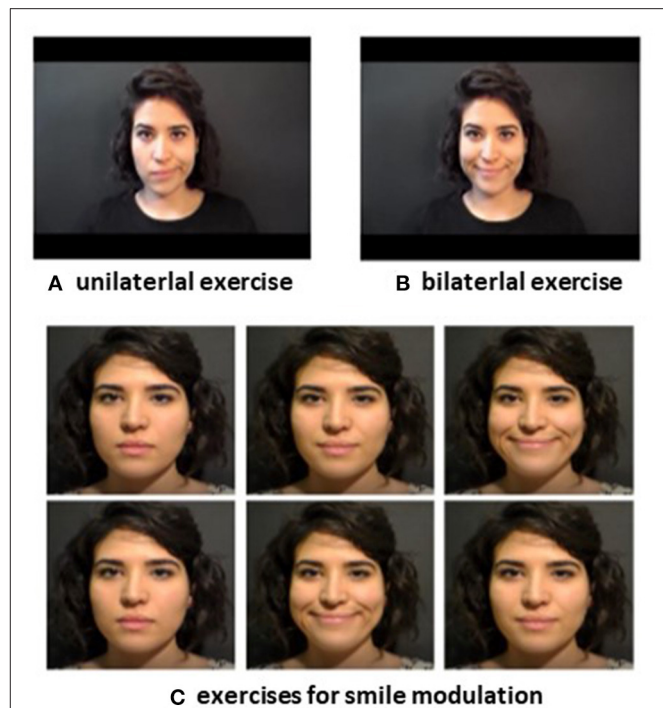
FIGURE 1 | FIT-SAT protocol consists in an action-observation protocol and it includes videos in which an actor performs smiles (facial imitation treatment, FIT) and provides instructions concerning both the co-activation of hand closed as a fist (synergistic activity treatment, SAT) and the number of repetitions that the patients will perform. Specifically, the FIT-SAT protocol consists in two phases: unilateral and bilateral phases. In unilateral phase the goal is to support patients in recruiting the transplanted muscle through unilateral exercises. The first unilateral phase starts about 8 weeks after the surgery, when the patients begin to recruit the transplanted muscle. It consists in the observation of a 3 s smile produced by an actor on a video and the instruction for the subsequent patient's synergetic hand-mouth contraction (A). The task of the patients is to imitate the actor's smile and, while they are smiling, simultaneously clench their fist. Each patient starts the daily session with five repetitions repeated for three times. Progressively, further repetitions are gradually included until the patient is able to perform at least ten successive repetitions and to maintain the posture for at least 3 s. This second phase starts after a clinical evaluation performed by the speech therapist who assesses the patient's ability to recruit the muscle without hand contraction. In the bilateral phase the goal is to achieve a symmetric smile and to be capable to modulate it through bilateral exercises (B). Bilateral exercises include modulation tasks in which the patient is asked to perform maximum and small (gentle) smiles in order to train and control the contraction force of the transplanted muscle/s (C).

High definition frontal-view photographs were captured with a digital camera Canon E0S 100D (18–55 mm lens, 18 megapixel) at a distance of 60 cm from the participants' face. We photographed the participants while holding the following