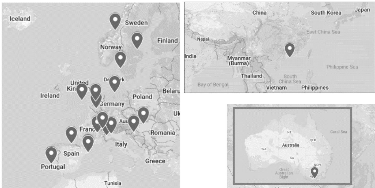
Fig. 2 Geographical location of the research centres involved in the study

remaining respondents ( N=7 ) are prominent figures at their centre as lead researchers or coordinators of team units.