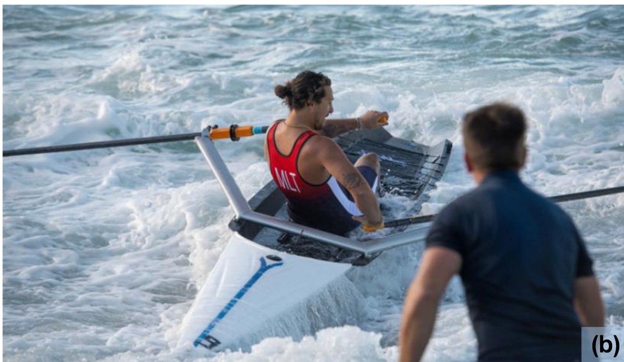
Fig. 1 a The race format of the Beach Sprint races in the (i) one against one, and (ii) processional time-trial format; b the C1x single rowing boat typically used in coastal rowing (taken from the 2024 World Championship)