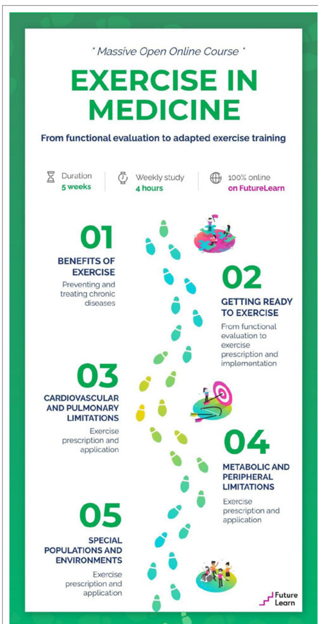
Figure 2 Graphic overview summarising the topics of each course week. In the interactive version (see: https://view.genial.ly/637f8df025d1600011c4c092 ), by clicking on the headlines of each week, you can view the summary of each week's thematic content.

This educational project has been dynamically supported by many high-level international experts in this specific field, providing an added value for this course. The course addresses many different physiological (such as exercise in childhood, pregnancy and the elderly) and pathological conditions, providing suggestions and strategies to bypass the underlying functional limitation with adapted exercise prescriptions for: - cardiovascular, respiratory, metabolic, neurological diseases; - patients with cancer, post solid organ transplantation, children and adults with congenital heart disease or other functional disabilities; - subjects during different stages of life and with mental health disorders.