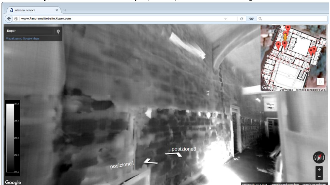
Figure 3. Thermal scan of the Servitski monastery in Koper. The different wall layout is highlighted by the thermal stimulus. The results are shown on a virtual visit of the building, where adjacent rooms could be easily compared [9].

Another survey, the Servitski Convent in Koper (Slovenia), is shown in the next Figure 3.