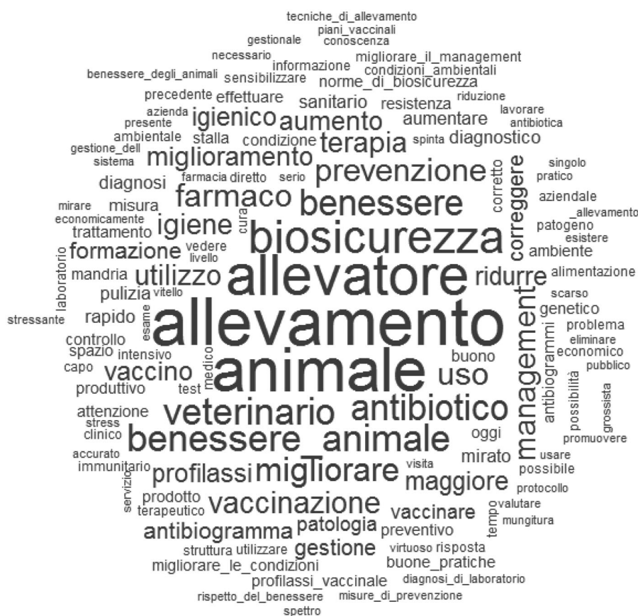
Figure 1. Word cloud of the strategies proposed by the cattle veterinarians. a Words with a greater number of occurrences included 'Rearing farm', 'Animal', 'Farmer', 'Biosecurity', 'Veterinarian', 'Antibiotic', 'Animal welfare', and 'Welfare'.