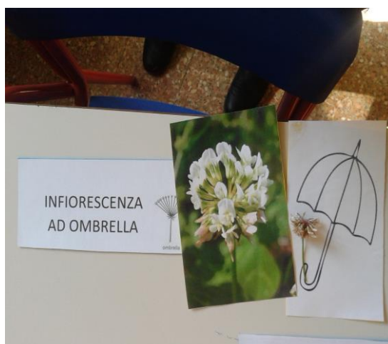
Figure 5 Flashcards created to play the "memory game" with the seven types of inflorescences; in the photo, the three cards are designed for the Umbel inflorescence.

In the same way as the flower, students were gradually introduced to the concept of inflorescences by the first observation of different samples. Inflorescences are divided into four macro categories and for everyone, there are a lot of different species. Since it is a complex argument for a second grade, I decided to teach only seven kinds of inflorescences (Umbel, Racemose corymb, Spadix, Head, Catkin, Racemose, Spike), and for doing it I created some cards for a "memory game": each species had three cards, one with the explicit name, one with an image of a specimen, and the last one with a reference that could be an object, an animal or figure, that recalls the species and acted as a hook between the kind of inflorescence and an object present in the everyday life of students (Fig. 5).