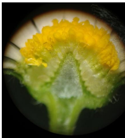
Figure 8 The Head inflorescence of a deasy shown using a microscope; pupils could distinguish the individual flowers that composed it.

When the two single didactics steps ended, was administered a test. The same test (the one on the flower) was administered to the control class, and in parallel to the workshop, activities have learned the concept of the flower with an educational trail of mere oral transmission of content. The results obtained from the tests on the flower in the two classes were qualitatively better in the experimental class, which showed to know acquaintances more deeply and maturely of the concepts, and also the functionality of all the structures presented. This confirms that this research presents an educational innovation project for two reasons: the methodologies implemented, which are more effective, and also for the topic of the inflorescences rarely treated by Science teachers.