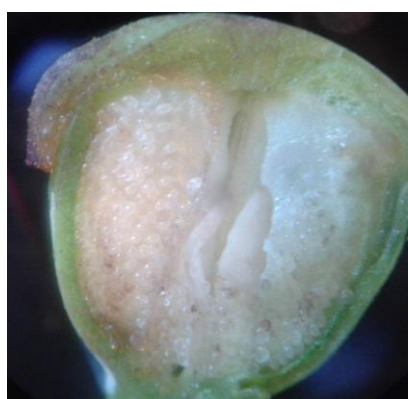
Figure 3 The ovary of a poppy shown to pupils with a microscope during laboratory didactics.

The ovary and the pollen, it was created in a laboratory using a microscope and through it, children were able to know other physical aspects of them (Fig. 3 and 4). At the end of the lessons, students had to fill the final part of their daily "card of the scientist" with the new knowledge learned during the lesson and compare them with the old knowledge. The recognition of the background knowledge was very important because it represents the starting point for the construction of the pupils' new knowledge.