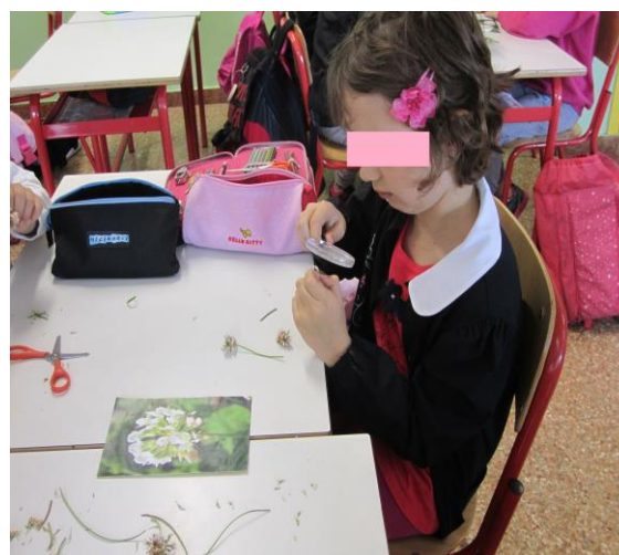
Figure 7 Example of laboratory activity during which pupils have used scientific tools to observe real flowers