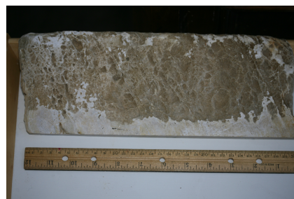
Figure 1. A sample of Chianocco marble used by the architect Filippo Juvarra in the 18th century on the facades of both Palazzo Madama (Turin, Italy) and the Castle in Rivoli (Piedmont, Italy).

Palazzo Madama in Turin (Italy) and the castle in Rivoli (Piedmont, Italy) are a couple of outstanding buildings conceived by the architect Filippo Juvarra, who worked in Piedmont during the 18th century. The so-called Chianocco marble (see Figure 1) is one of the stones applied on the facades of such buildings. It is characterized by a good workability, and for this reason, it is preferred to other stones.