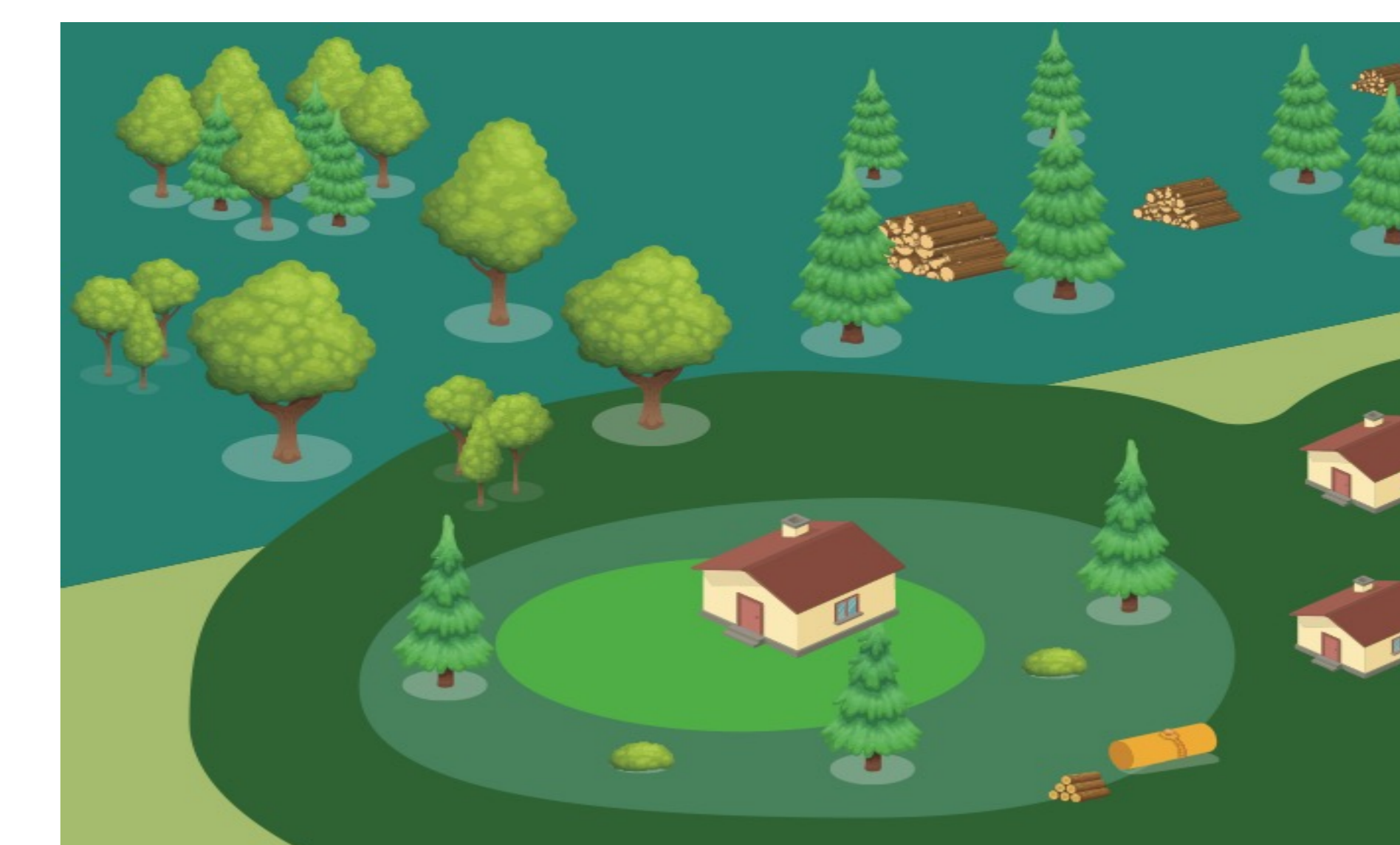
Fig. 2 Wildland fire risk mitigation actions in the WUI

Land managers will benefit greatly from resulting fire risk maps, including closer-to-reality fuel and asset arrangement, allowing them to better allocate resources for risk mitigation. In addition, based on fire risk mapping, silviculture interventions can be designed to reduce fuel load and continuity maximising their effectiveness to lower fire risk. Specific fuel management options can also be planned in the proximity of buildings to increase their safety (Fig 2).