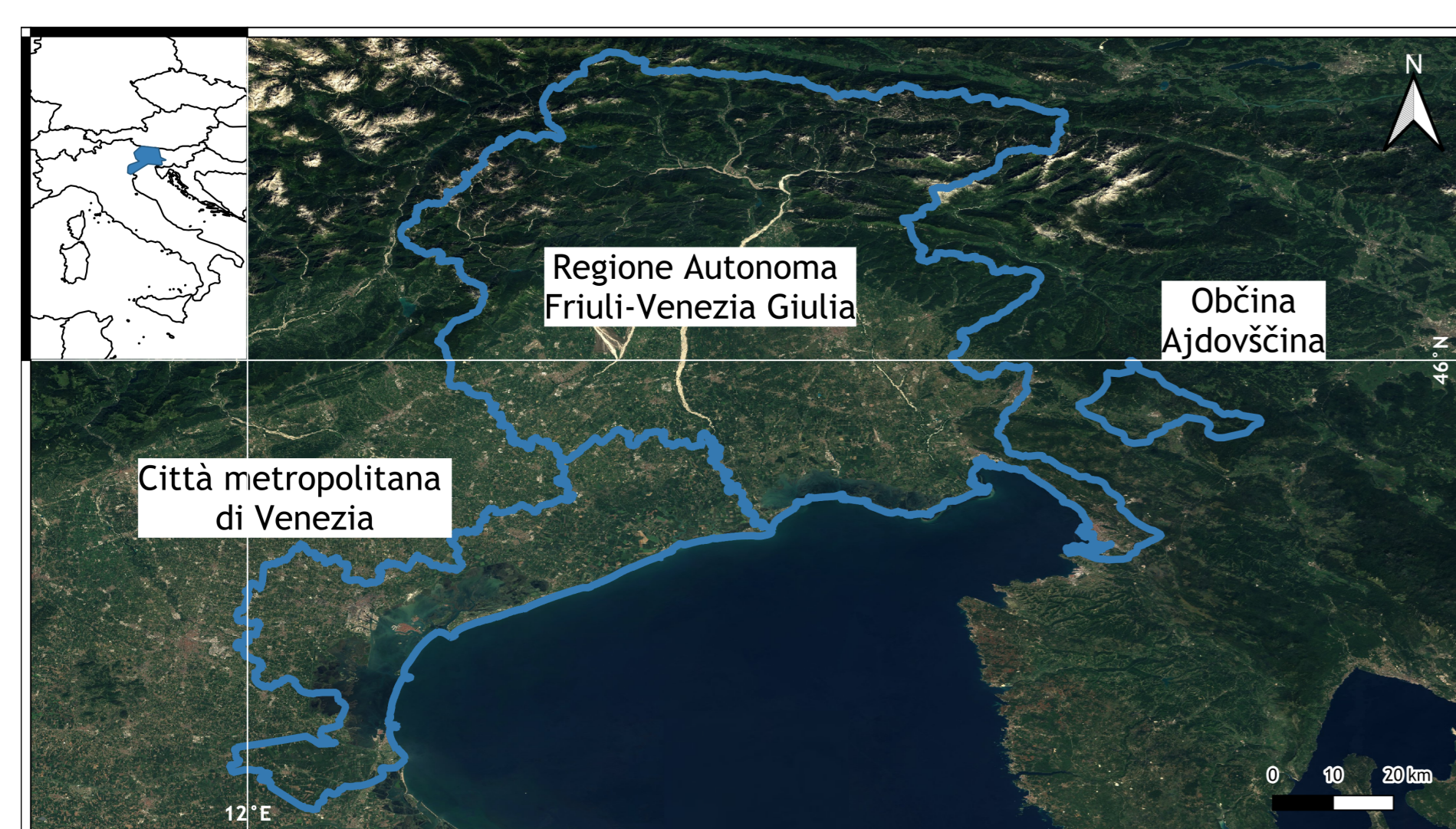
Fig. 1 Study areas for the Action 3.2.3 of CROSSIT SAFER

Action 3.2.3 of the project CROSSIT SAFER funded by Cooperation Programme INTERREG V-A Italy-Slovenia 2014-2020 ( www.ita-slo.eu/en/crossit-safer ) is aimed at finding an innovative method to map and assess forest fire risk with a focus on WUI areas. This project uses advanced remote sensing technologies to capitalise on the outputs of previous EU projects (Fig. 1).