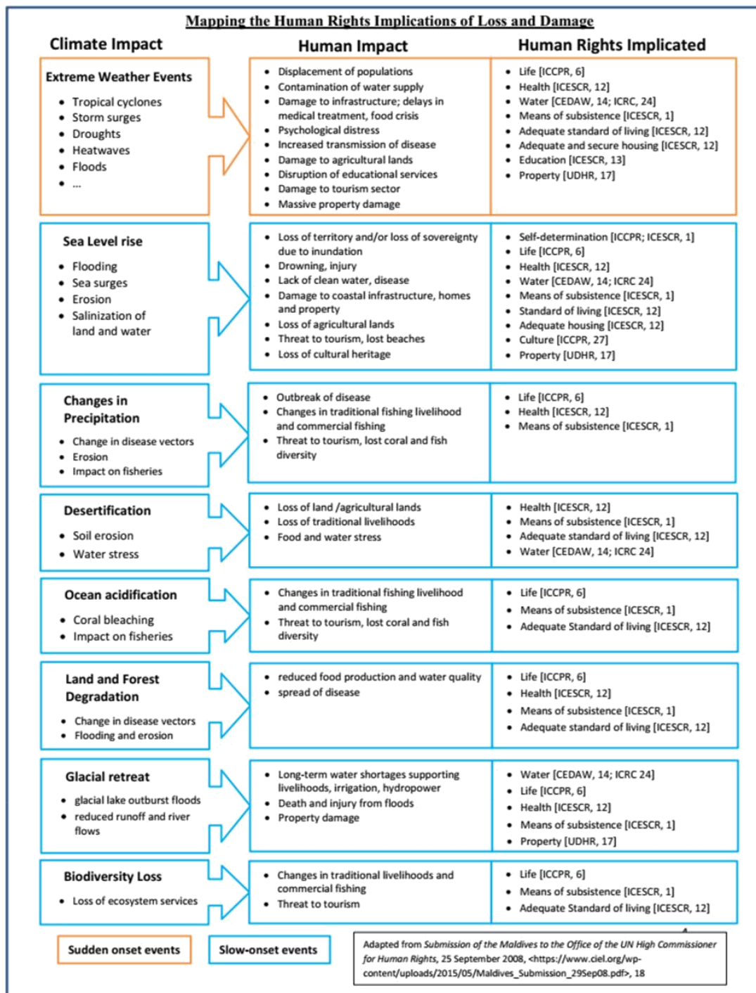
Figure 1. Mapping the Human rights implications of Loss and Damage, adapted from submission of the Maldives to the Office of the UN High Commissioner for Human Rights, 25 Sept. 2008.