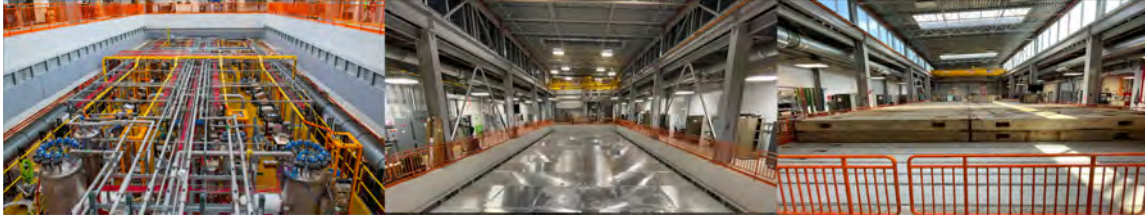
Figure 1: Assembly activities in the ICARUS detector: left shows TPC, PMT and part of the cryogenic subsystems installed, middle picture the fully completed CRT and finally the blocks of concrete overburden being put into place on the right.

4.1 \cdot 10^{19} for BNB and 6.8 \cdot 10^{19} for NuMI. The summer pause provided an opportunity to carry out several activities in preparation for the subsequent neutrino physics run, mainly dedicated to improving the performance of the detector and the stability of data collection. ICARUS was brought back to physics data taking by the end of 2022 and has successfully concluded Run 2 on July 2023, collecting large statistics; Run 2 collected 2.1 \cdot 10^{20} for BNB and 2.8 \cdot 10^{20} for NuMI. The free electron lifetime is crucial to monitor the liquid argon purity in the TPCs and to ensure no ionization charge signal is lost, thus it has been monitored through the whole life of the detector. East cryostat has had a stable value of 4.5 ms during the whole commissioning phase and physics runs, whereas an increase from 3 ms to 8.5 ms was seen in the West cryostat after the regeneration of its cryogenic filter during the summer shutdown. The filter regeneration of the East module has been recently completed in September 2023, and should allow the module to reach values similar to those of the West cryostat in the near future.