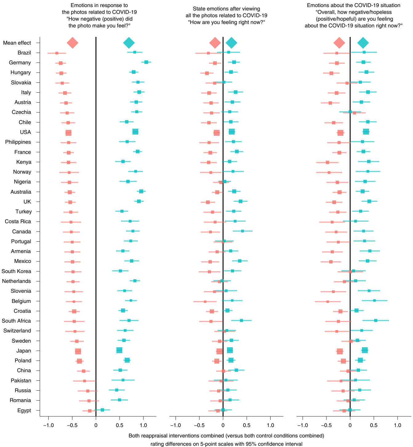
Fig. 1 | Effect sizes of both reappraisal interventions combined (versus both control conditions combined) on primary outcomes by country/region.

Valence ◆ Negative ◆ Positive Sample size ■ 200 ■ 800 ■ 2,400