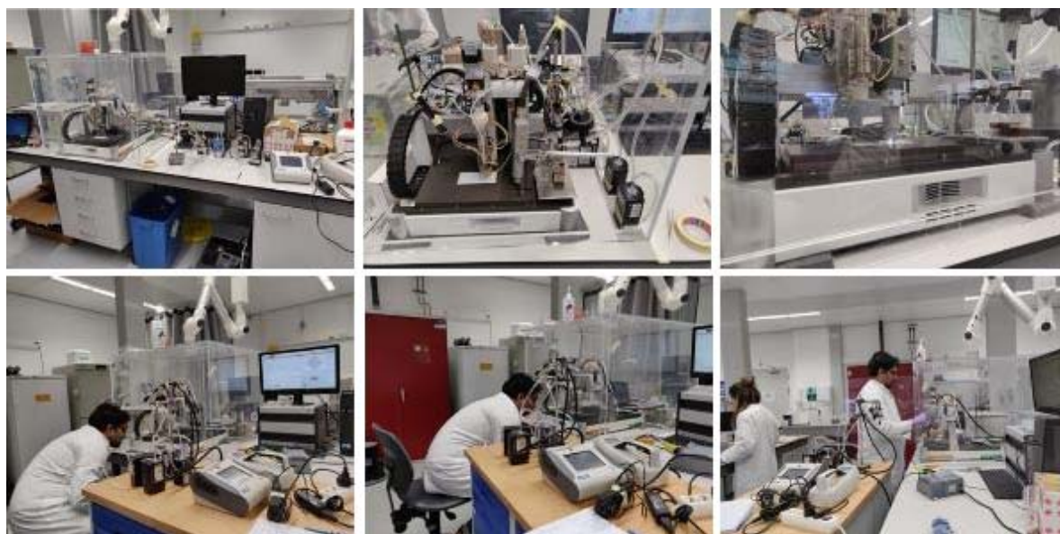
Figure 2. Different pictures of the FAST 3D prototype installed in the research laboratory of Maastricht University, showing the deployment of instrumentation for the measurement of emissions and exposures to NOAAs, during the verification stage of the prototype design.

In general, the measurement strategy was based on the OECD tiered approach [36], by including the collection of information on the toxicology of the nanofillers (rGO, n-HA and LDH-CFX) and process characteristics (Tier 1), as well as the development of a basic measurement campaign using handled devices and filter sampling (Tier 2).