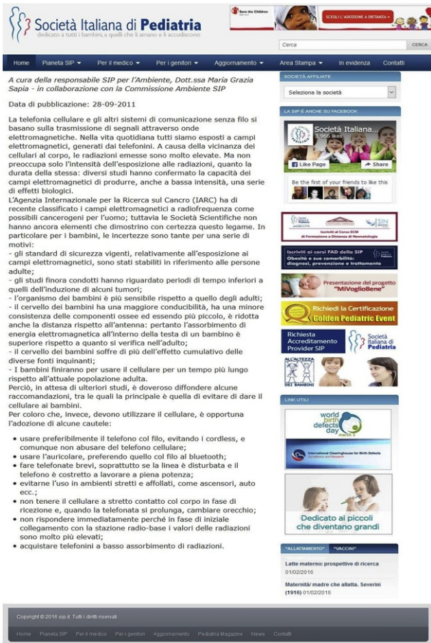
Fig. 1 Screenshot of one of the websites used. (Figure 1 should not appear here. The right place is in the Method section (see where I included the citation to this figure).)